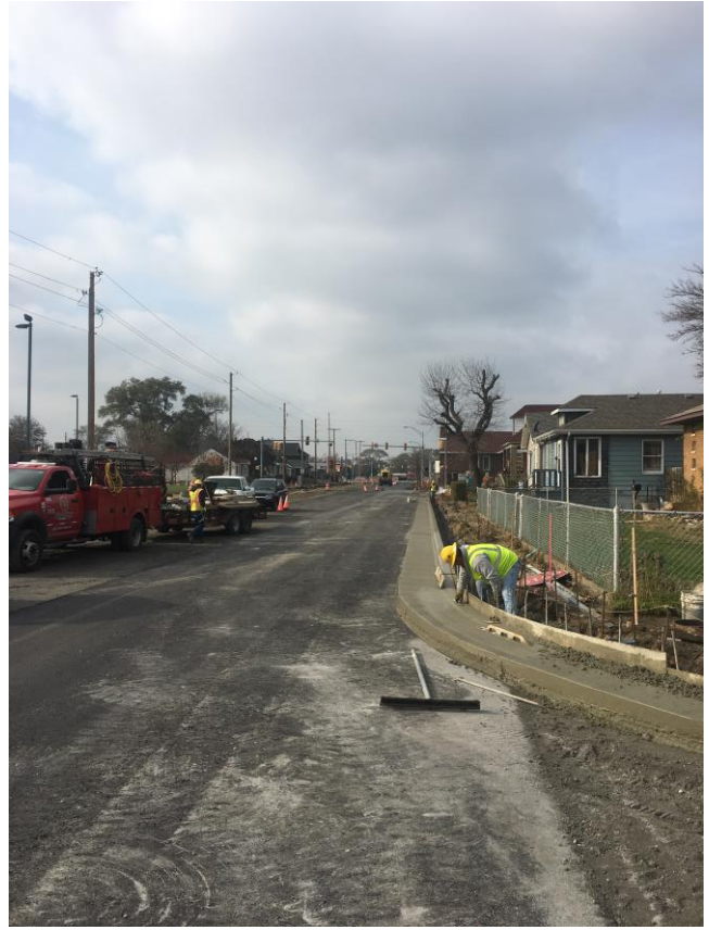
Curb and Gutter Finishing