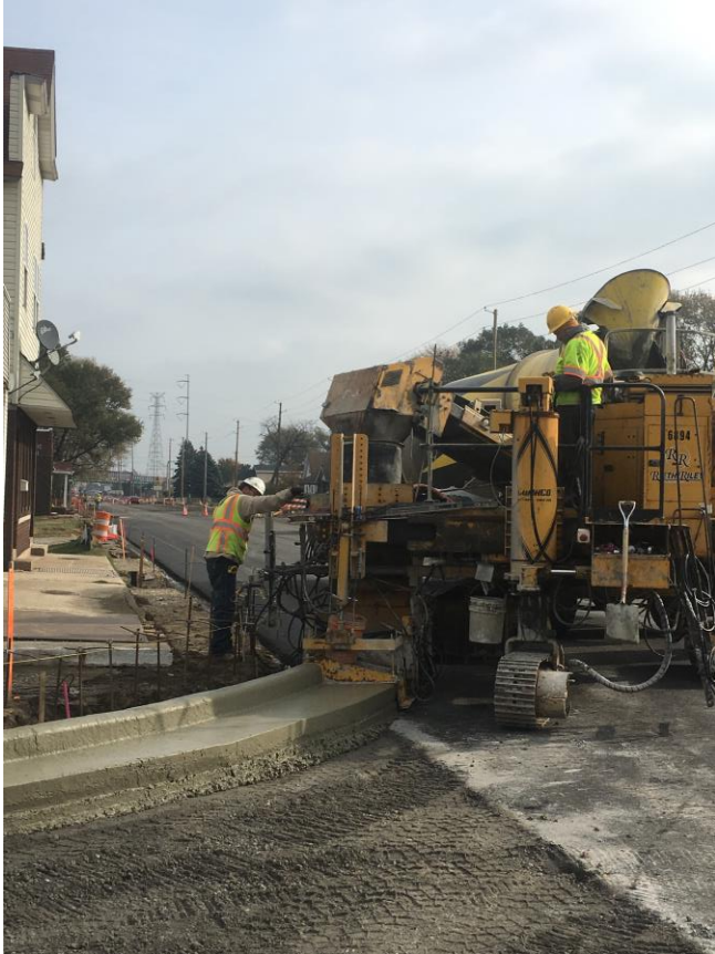
Curb and Gutter Pouring