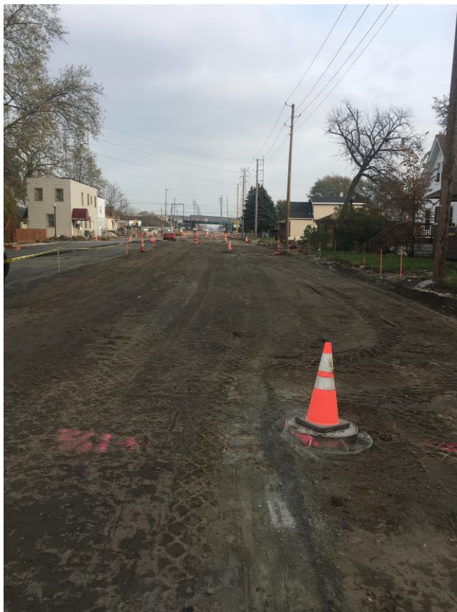
South Side Sub-grad Treatment (Stabilization)